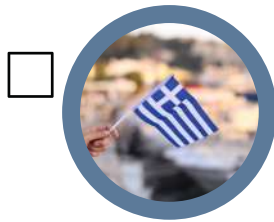
A GREEK FLAG