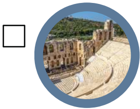
AN ANCIENT THEATER

• Look around you... Can you spot any of these?