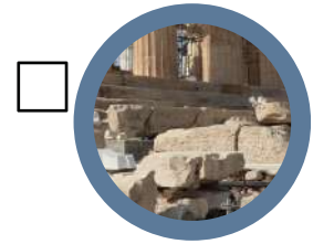
ANCIENT HUGE STONES