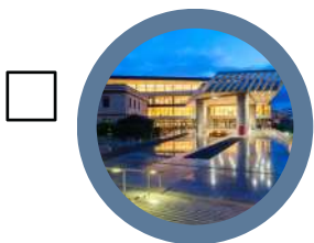
A MUSUM NEARBY