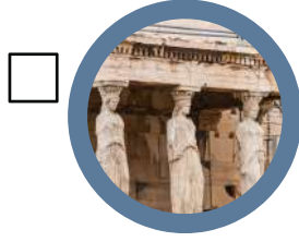
WOMEN AS COLUMNS (CARYATIDS)