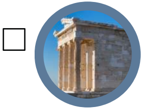
ATHENA NIKE TEMPLE